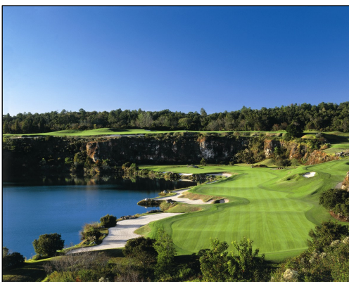
Black Diamond, Lecanto