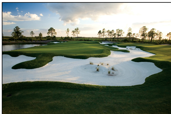
Old Corkscrew Golf Club, Estero